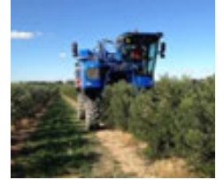
Bush (intensive 250-600 trees/ha)