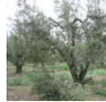
Vase (2-3 stems from soil)