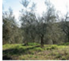
Vase (1 stem)