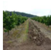
Bush/Globe (very small trees)